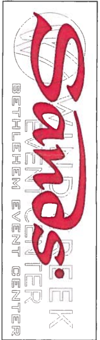
A Signage - Overlay