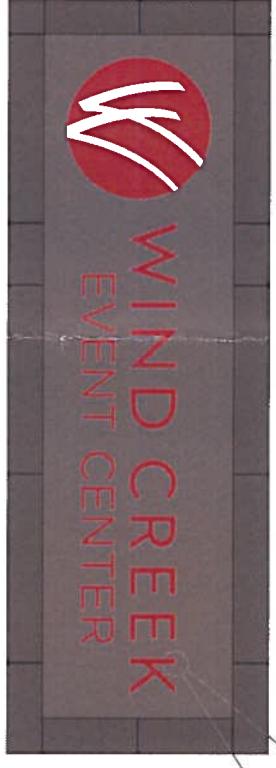
C Proposed Signage - Night View