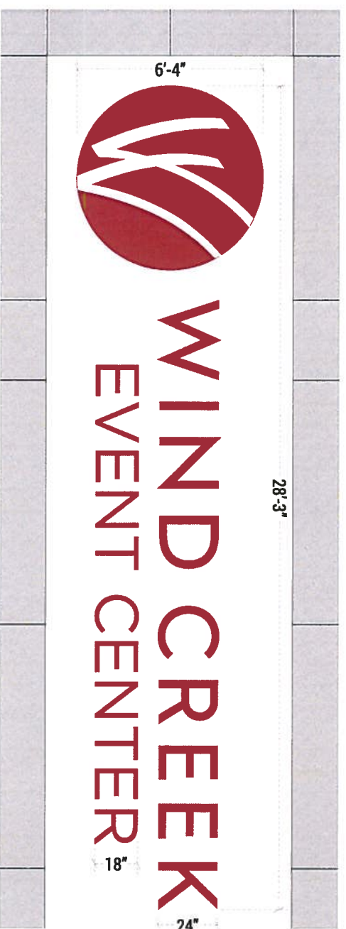
A Proposed Signage