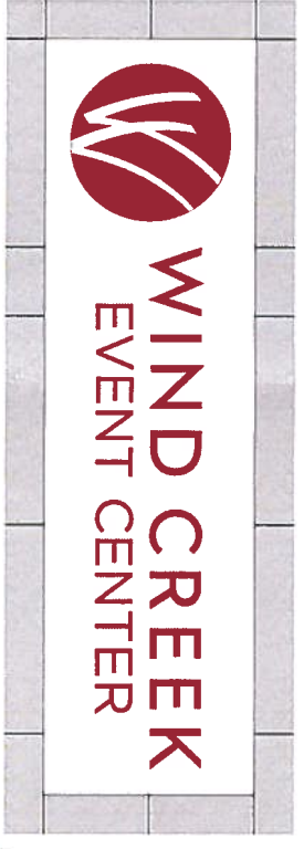
B Proposed Signage